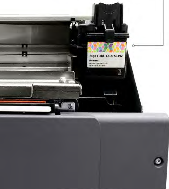
Under the Hood

LX910's technology allows you to easily switch between dye and pigment ink without having to change the print head.